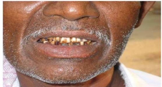
Fig. 2: Skeletal and Dental fluorosis in Bommireddy palli of Prakasam District Fig. 3: Skeletal and Dental fluorosis in Kasipuram of Prakasam District